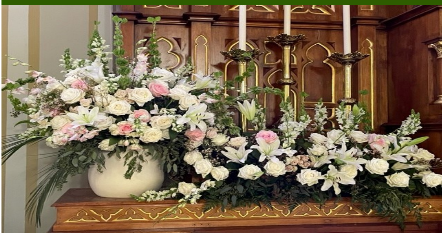
402 South Kirkland Drive (River Road)