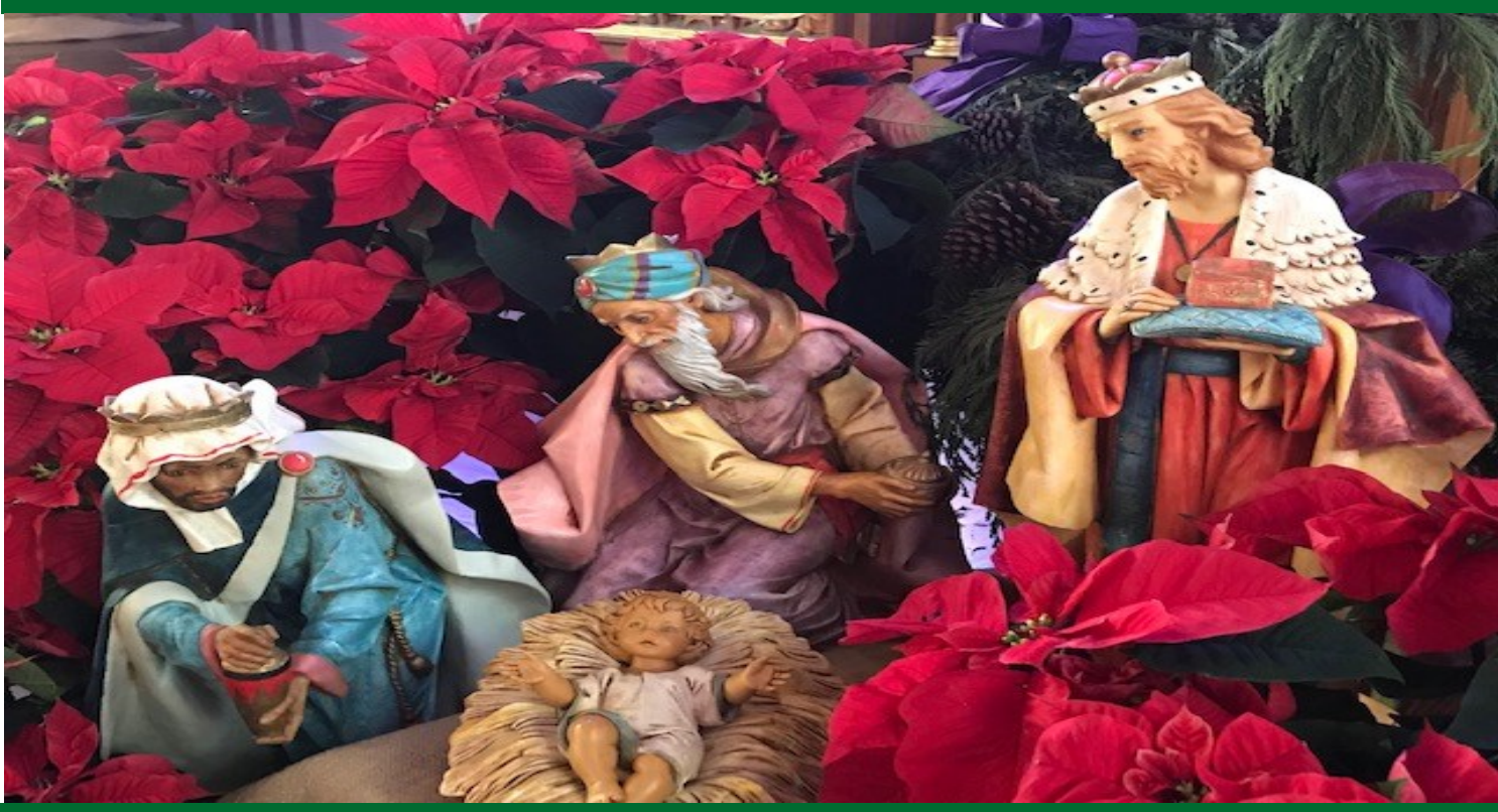
402 South Kirkland Drive (River Road) P. O. Box 248, Brusly, Louisiana 70719