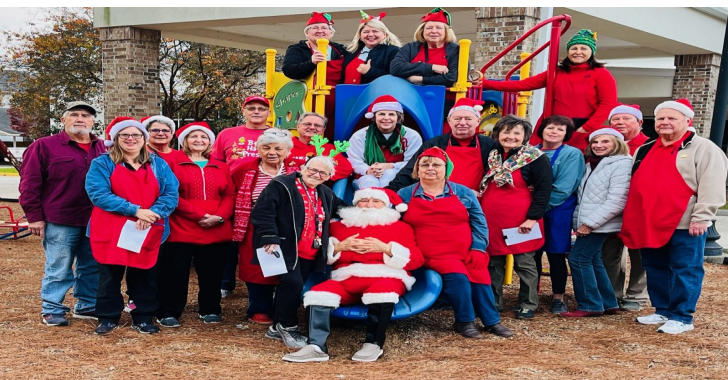
Many thanks to our hard working volunteers of the Zippers! Their Sales begin at 7:30am on January 11th & 25th. Donations may be dropped off by their door. No furniture please!

The Sacrament of Confirmation is scheduled for Thursday, January 18th at 7:00pm. A reception will follow in the Activity Center for all Confirmation Candidates and their families.