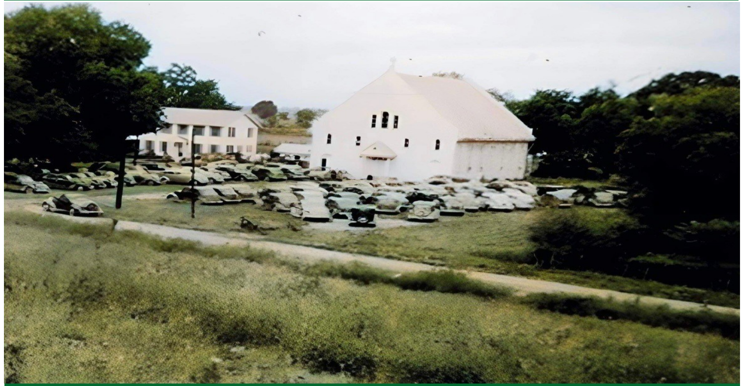
402 South Kirkland Drive (River Road) P. O. Box 248, Brusly, Louisiana 70719