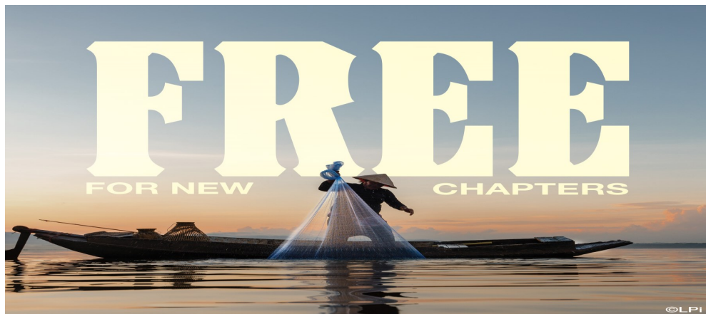
GOSEL MEDITATION - ENCOURAGE DEEPER UNDERSTANDING OF SCRIPTURE

February 9, 2025 5 th Sunday in Ordinary Time Luke 5:1-11