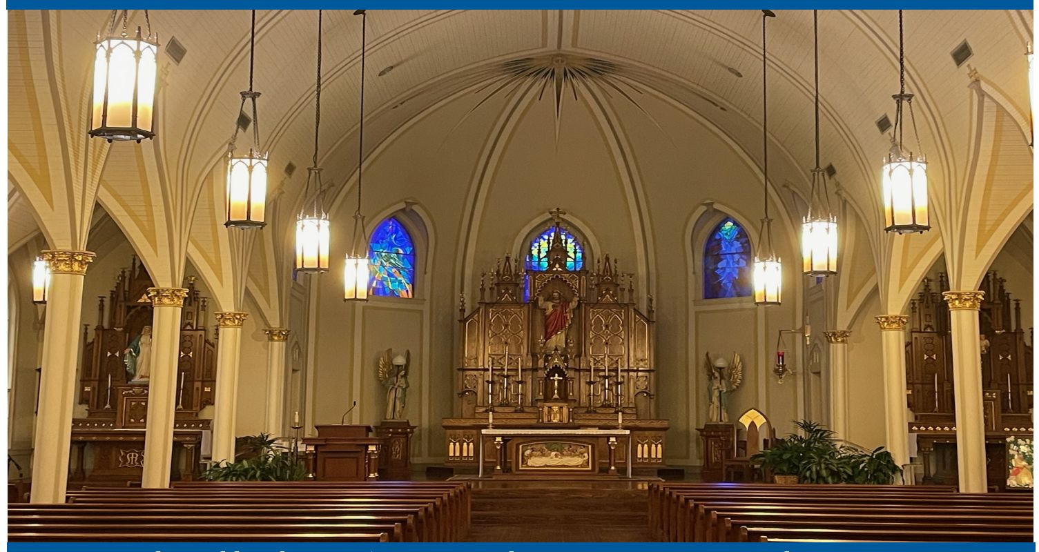
402 South Kirkland Drive (River Road)