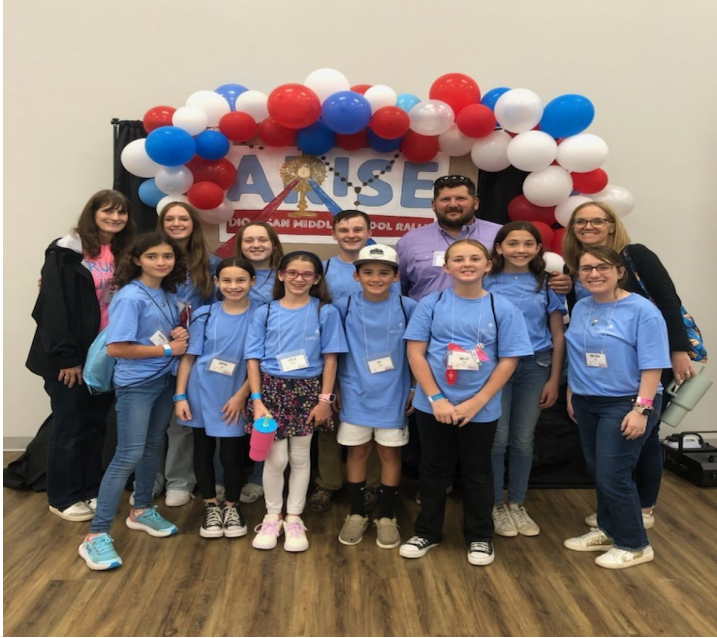
Pictured is our Christian Formation Students at Arise Youth Rally Middle School on March 29th at St. Alphonsus Church

First Eucharist will be celebrated at 2:00pm on Sunday, May 4th.